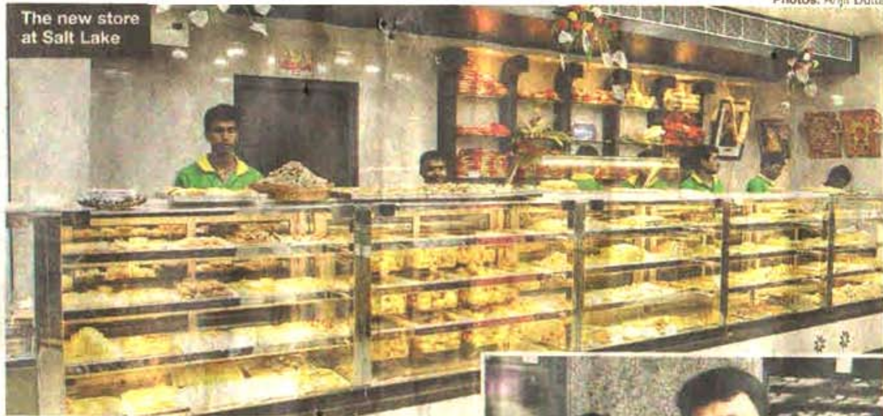
The new store at Salt Lake

K olkata is not only known for its rich socio-cultural heritage, but also for its old-world ambience and of course, its food and sweets. Myriad sweetshops have managed to create a place in the hearts of the city's residents. And one of the city's most popular sweetshops is Gupta Brothers, which began its journey on the auspicious day of Buddha Purnima in 1888.